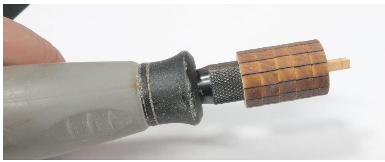
wobble. Slide it all the way back on the tool to minimize any wobble.

Then put it back on the stick...chock it up in your dremel or other rotary tool. If you have a lathe that is great also and you won't have any wobble as you sand the barrel to shape. A late is the best way to go but if you use a Dremel try and minimize the